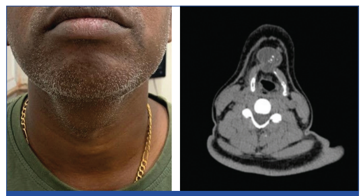
[Table/Fig-1]: Preoperative picture of the swelling in midline of neck; [Table/Fig-2]: CECT image showing cystic lesion with solid area component and foci of calcification. (Images from left to right)

to trace tract superiorly.High ligation was done and specimen was removed [Table/Fig-4]. Haemostasis secured. Suction drain of size 22 and stay sutures were placed. Strap muscles were approximated and midline subcutaneous sutures with subcuticular skin sutures were given. Patient was extubated and shifted to to intensive care unit under stable condition.